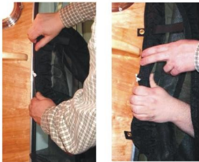
Figures 6 & 7

Step 4 - Lay out screen door and determine what is top. The wide band of material is the bottom. Find the white rope knot on the front edge of screen. Align knot with the 21" pencil mark. Feel the edge of the screen for the rope sewn into it. Push the hemmed in rope into the groove found in the edge of the aluminum trailer door frame as shown in figures 6 & 7.