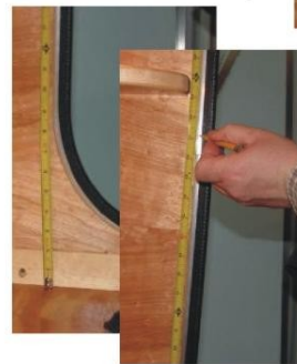
Figures 4 & 5

Step 3 - Measure up from the floor of the trailer along the front edge of the door opening. Mark the aluminum door frame at 21" as shown in figures 4 & 5.